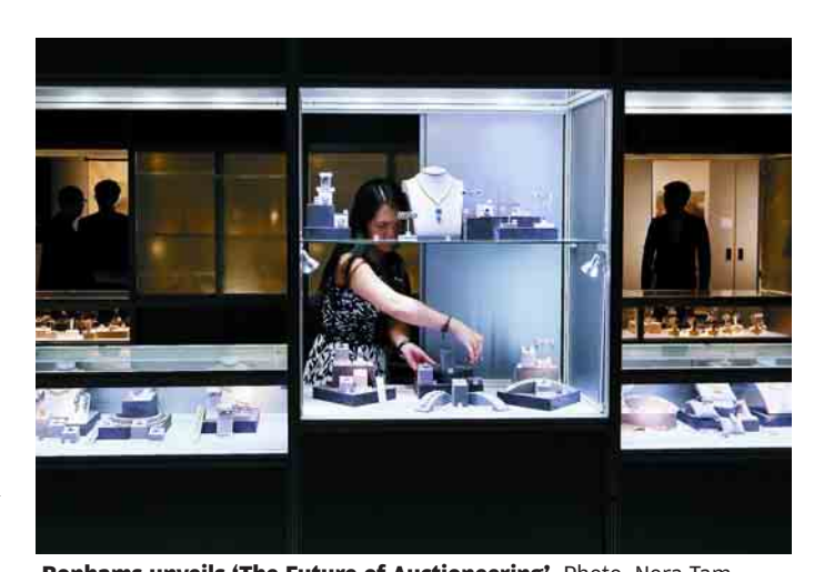
Bonhams unveils 'The Future of Auctioneering'.