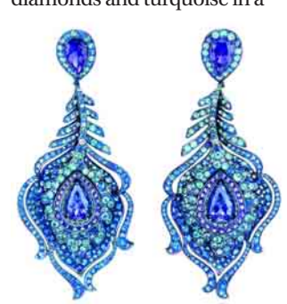
Chopard's peacock feather gemstone earrings in 18ct white gold and titanium

There was a debate as to whether the tourmalines found in Africa can bear the Paraiba name but, nowadays, the jewellery houses describe them as African Paraiba, or sometimes simply as tourmalines. Their luminous hue is popular with jewellers, complemented beautifully by emeralds in the Baia Verde necklace by Van Cleef & Arpels or enhanced with diamonds and turquoise in a