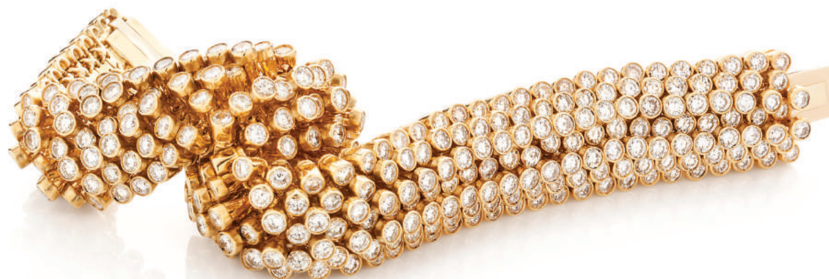
One-of-a-kind rings from the Paraiba collection Diamond bracelet from the Boa collection

23 Burlington Arcade Mayfair W1J 0PR London UK · +44(0)207 409 0110 contact@nourbel-lecavelier.com · www.nourbel-lecavelier.com