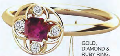
GOLD, DIAMOND & RUBY RING, £1,950, BY MALLORY