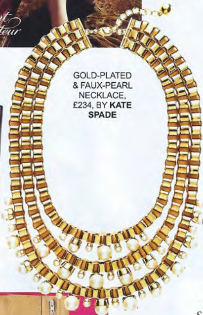
GOLD-PLATED & FAUX-PEARL NECKLACE, £234, BY KATE SPADE