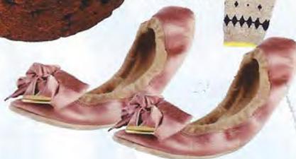
SATIN SLIPPERS, £175, BY BURBERRY