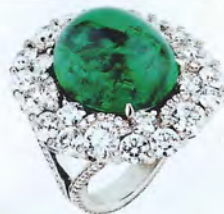
GOLD, DIAMOND & EMERALD RING, POA, BY FABERGÉ

And now for the best news OF YOUR LIFE – designers are recreating Disney Princess dresses on the fourth floor of Harrods : the Pocahontas dress by Roberto Cavalli, Cinderella's dress by Versace, and more. This is actually happening! harrods.com