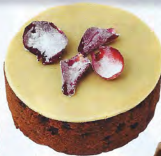
CHRISTMAS CAKE, £15, BY GAIL'S