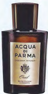
COLONIA INTENSA OUD, £130 FOR 110ML, BY ACQUA DI PARMA