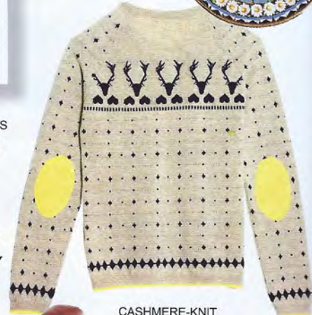
CASHMERE-KNIT JUMPER, £350, BY CHINTI AND PARKER