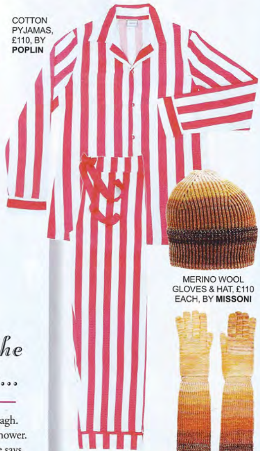
COTTON PYJAMAS, £110, BY POPLIN