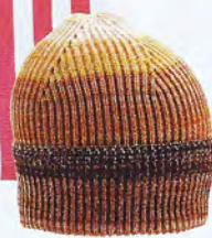
MERINO WOOL GLOVES & HAT, £110 EACH, BY MISSONI