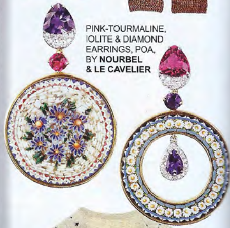
PINK-TOURMALINE, IOLITE & DIAMOND EARRINGS, POA, BY NOURBEL & LE CAVELIER