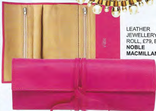
LEATHER JEWELLERY ROLL, £79, BY NOBLE MACMILLAN