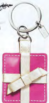
KEY FOB, £35, BY COACH

CHRISTMAS HOME-DECORATING COURSE, FROM £350, AT BY APPOINTMENT ONLY DESIGN (BYAPPOINTMENT ONLYDESIGN.COM)